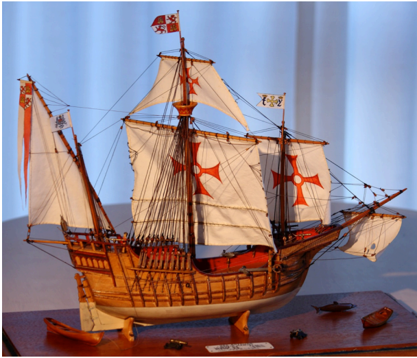
Spanish Caravel 15 th Century