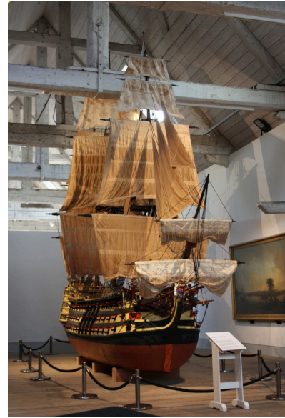
European Galeon 16 th Century