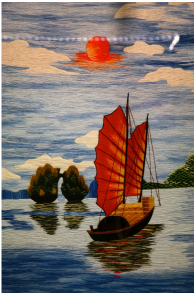
Chinese Junk 12 th -15 th Century