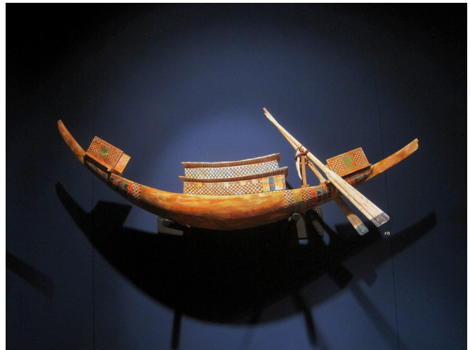
Egyptian Boat 3000BC